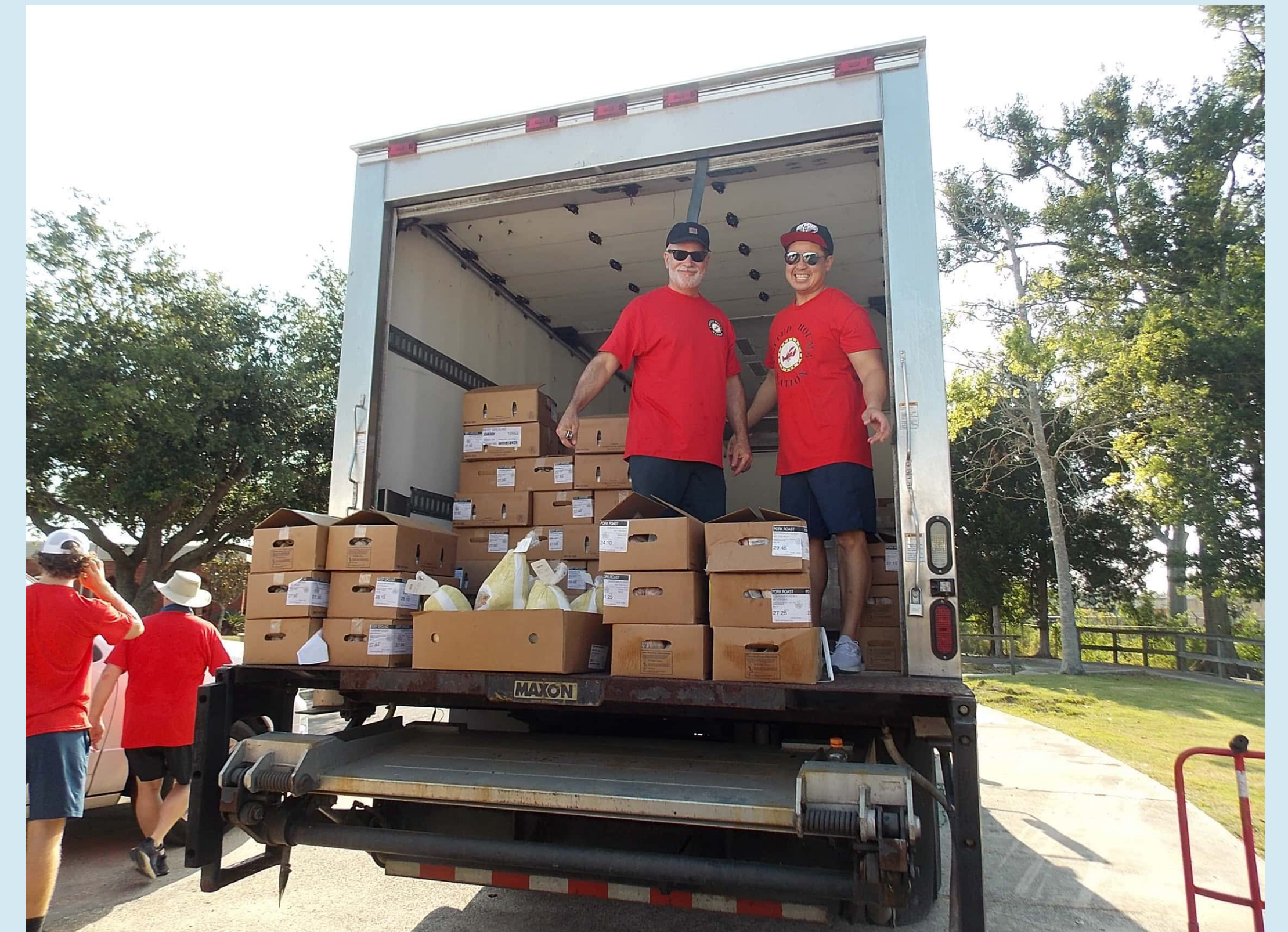
UHN supply distribution

Similar to the Central Hub, the purpose of the Satellite Hubs is to increase resilience across the region through the provision of emergency services and resource distribution during gray skies, as well as to fill community programming and service needs throughout the year (i.e., during blue skies). The UHN has met with all six parish governments that comprise their service area to introduce the Tribal Resilience Plan and to begin collaborating on establishing satellite community resilience hubs in each parish. For potential Satellite Hub sites owned by partners (including parish and city governments), the focus will be on leveraging buildings that are already a point of gathering for members of the community that need enhancements to better serve safely and effectively during and after disasters. The Terrebonne Satellite Hub already has a potential location identified and the needed improvements have been established. Steering committees comprised of community members will be developed for each parish to identify sites for each of the other five hubs.